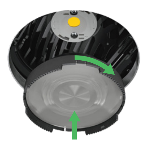
Narrow Flood, Flood & Linear Spread Lens utilize smaller optic