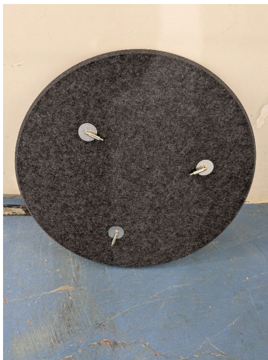
Figure 3 – Individual specimen object