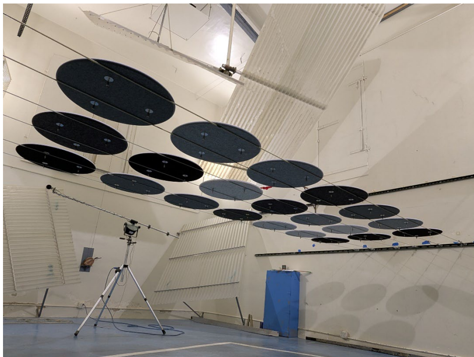
Figure 2 – Specimen mounted in test chamber