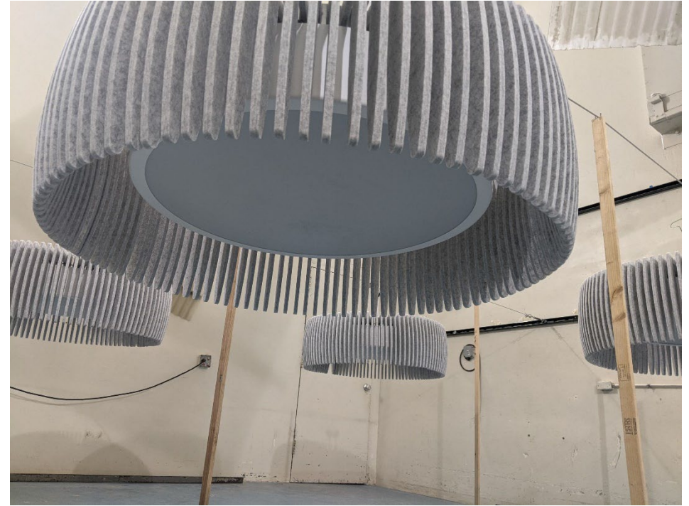
Figure 2 – Specimen mounted in test chamber