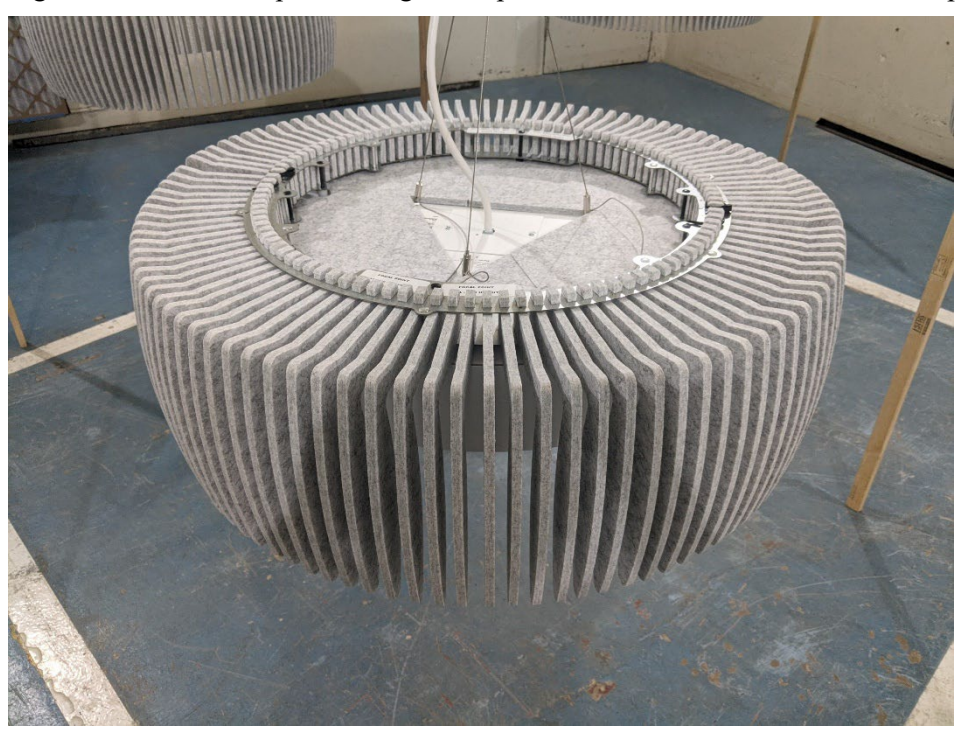
Figure 4 – Individual specimen light unit with felt fins installed

Figure 3 – Individual specimen light unit prior to installation of felt fins around perimeter