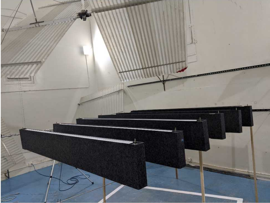
Figure 1 – Specimen mounted in test chamber