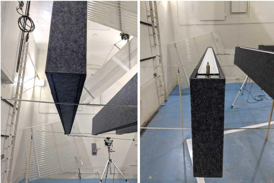
Figure 2 – Individual specimen object, faces oriented toward (left) and away from (right) horizontal test surface