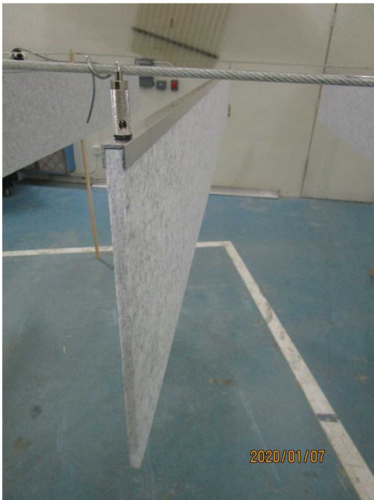
Figure 2 – Detail of individual baffle materials