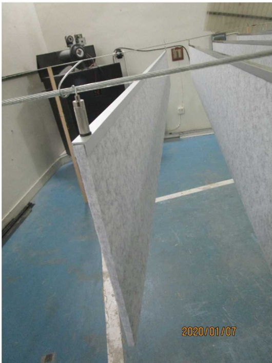
Figure 2 – Detail of individual baffle materials