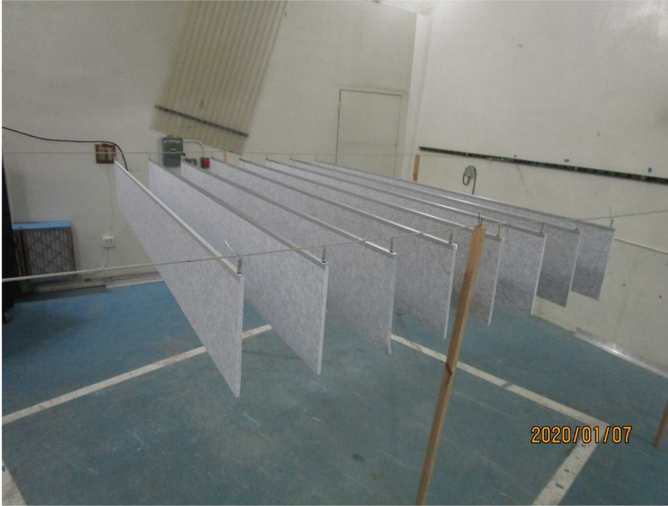
Figure 1 – Specimen mounted in test chamber