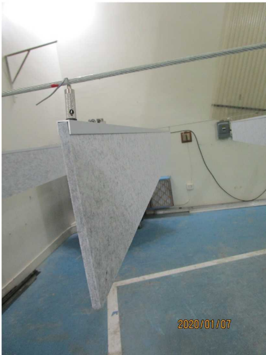
Figure 2 – Detail of individual baffle materials