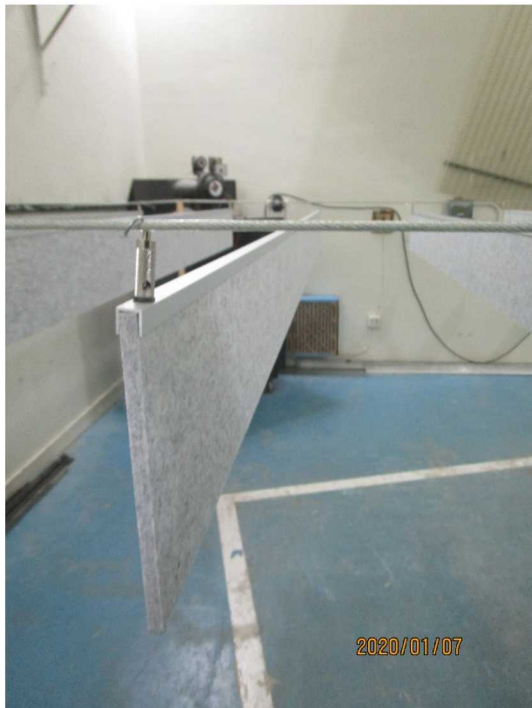
Figure 2 – Detail of individual baffle materials