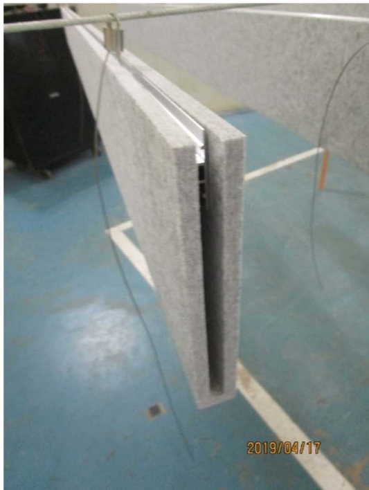
Figure 2 – Detail of individual baffle