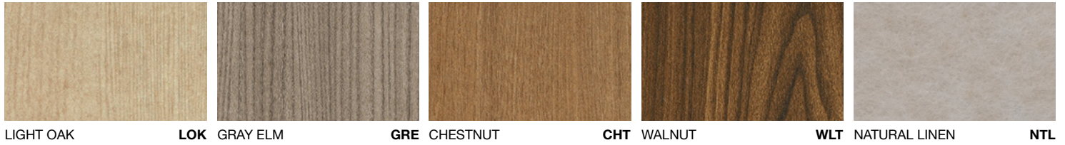
LIGHT OAK LOK GRAY ELM GRE CHESTNUT CHT WALNUT WLT NATURAL LINEN NTL