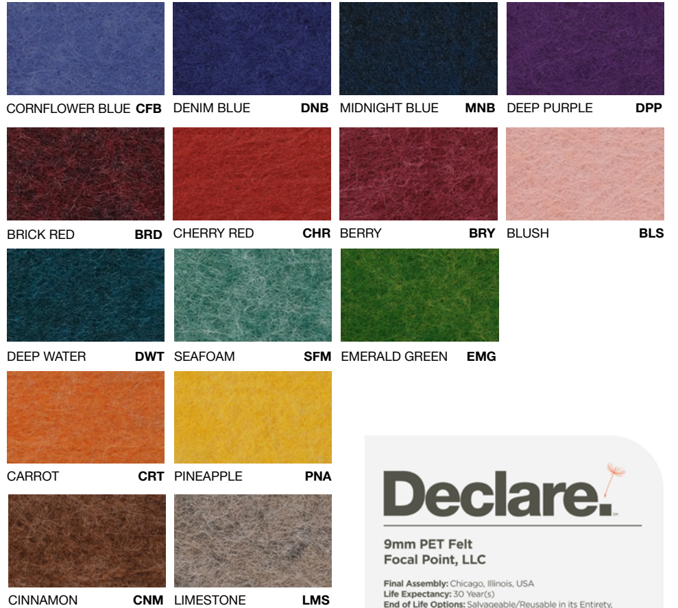
CORNFLOWER BLUE CFB DENIM BLUE DNB MIDNIGHT BLUE MNB DEEP PURPLE DPP BRICK RED BRD CHERRY RED CHR BERRY BRY BLUSH BLS DEEP WATER DWT SEAFOAM SFM EMERALD GREEN EMG CARROT CRT PINEAPPLE PNA CINNAMON CNM LIMESTONE LMS