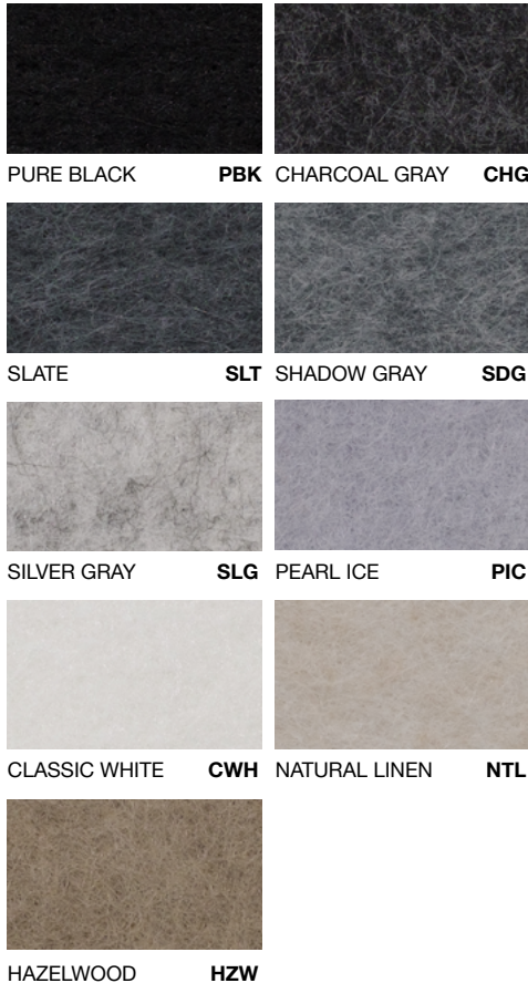
PURE BLACK PBK CHARCOAL GRAY CHG SLATE SLT SHADOW GRAY SDG SILVER GRAY SLG PEARL ICE PIC CLASSIC WHITE CWH NATURAL LINEN NTL HAZELWOOD HZW