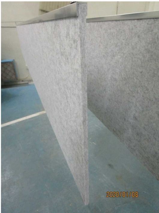
Figure 2 – Detail of individual baffle materials