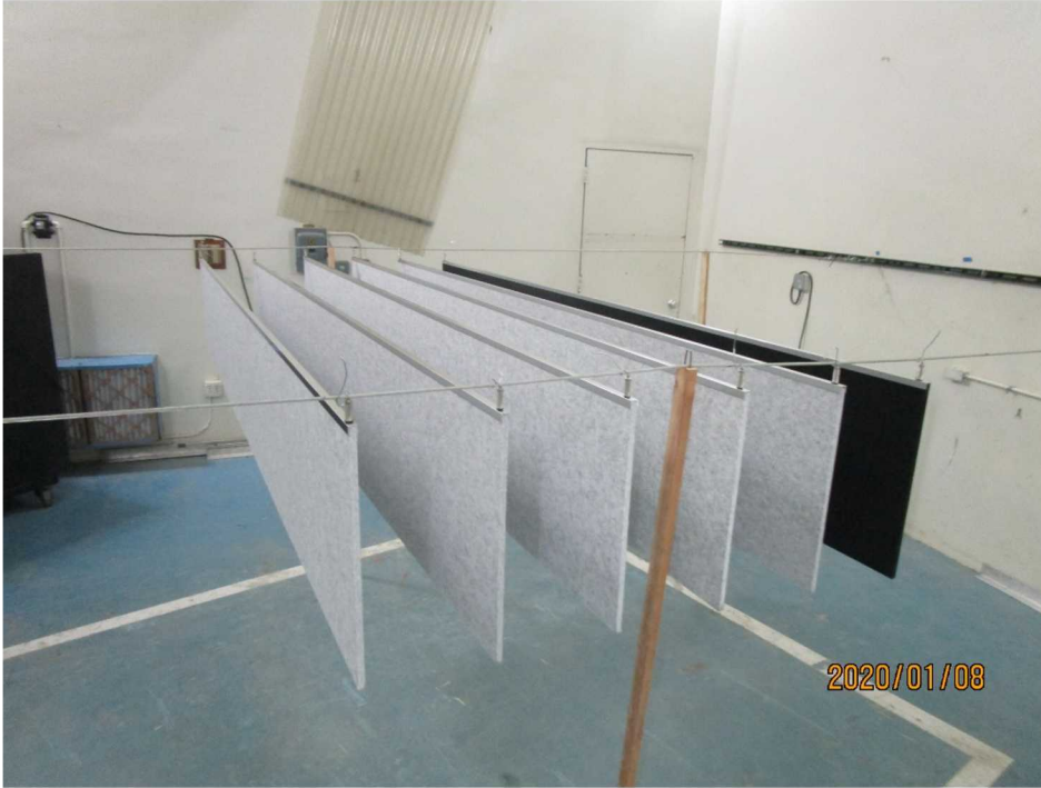
Figure 1 – Specimen mounted in test chamber