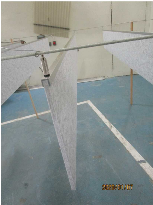
Figure 2 – Detail of individual baffle materials