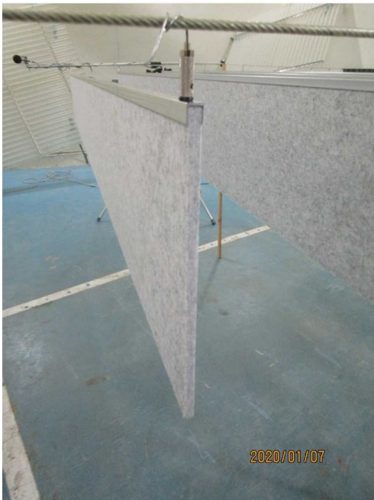
Figure 2 – Detail of individual baffle materials