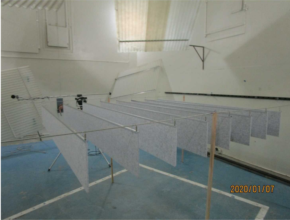
Figure 1 – Specimen mounted in test chamber