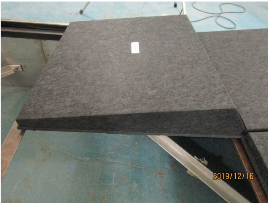
Figure 2 – Detail of individual tile, protrusion depth profile