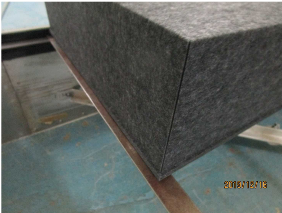
Figure 2 – Detail of specimen materials