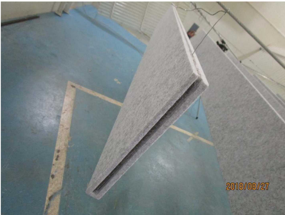
Figure 2 - Detail of individual baffle