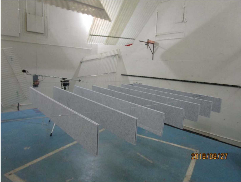
Figure 1 - Specimen mounted in test chamber